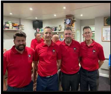
Surrey AGU v Hertfordshire