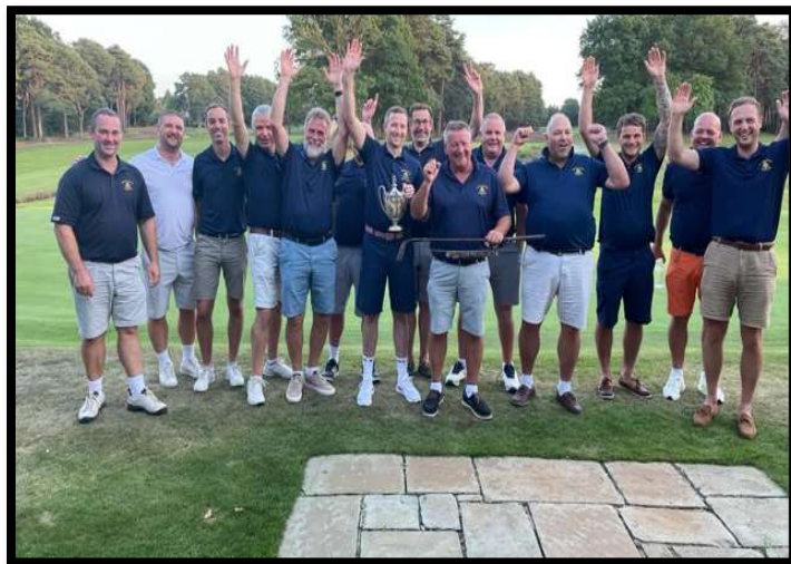
HHA v Woking GC

Founded in 1924, the 60 Hook Heath Artisan (and Honorary) members and committee have been preparing for their Centenary year next year and look forward to another similar successful year in 2024.