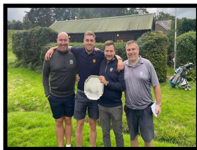
Finalists – Cantelupe v R Mid Surrey