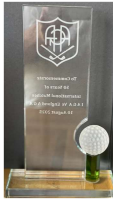
Plaque Presented to The Irish

There are far too many to mention here but you know who you are!