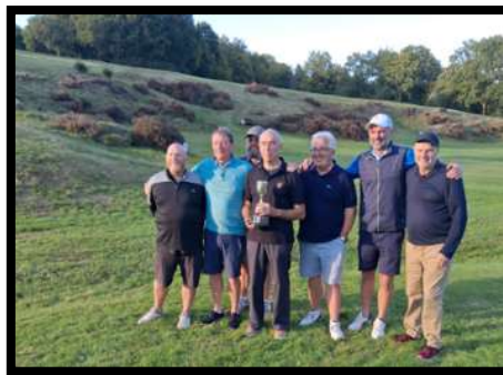
Winning team Cantelupe '